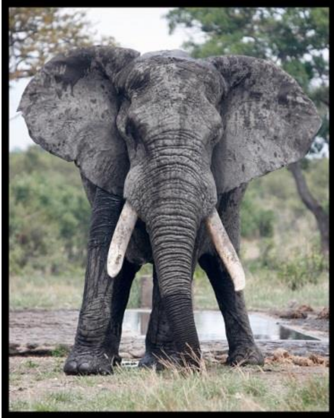
Elephant